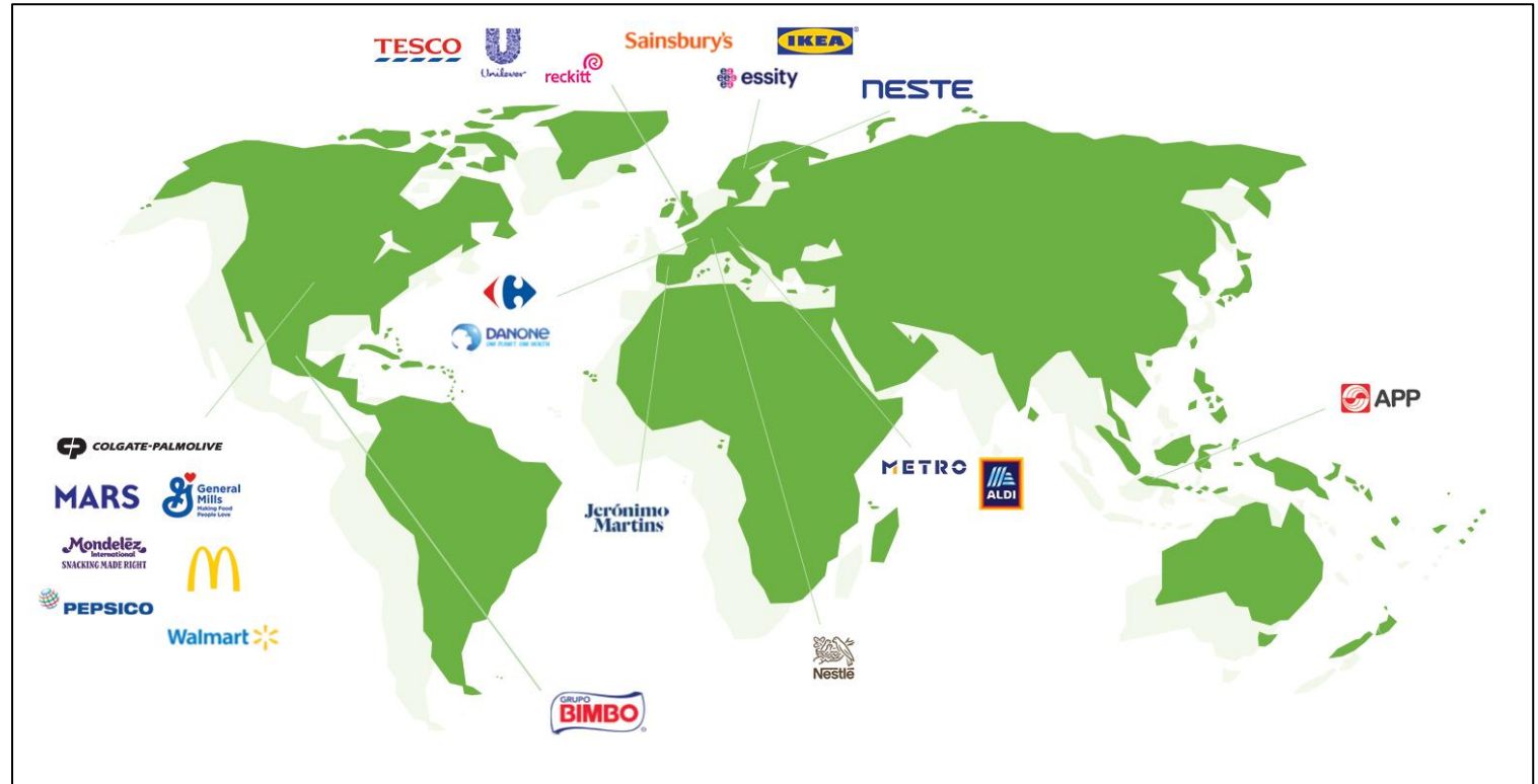
Forest Positive Coalition members as of January 2025