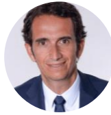
Alexandre Bompard CEO