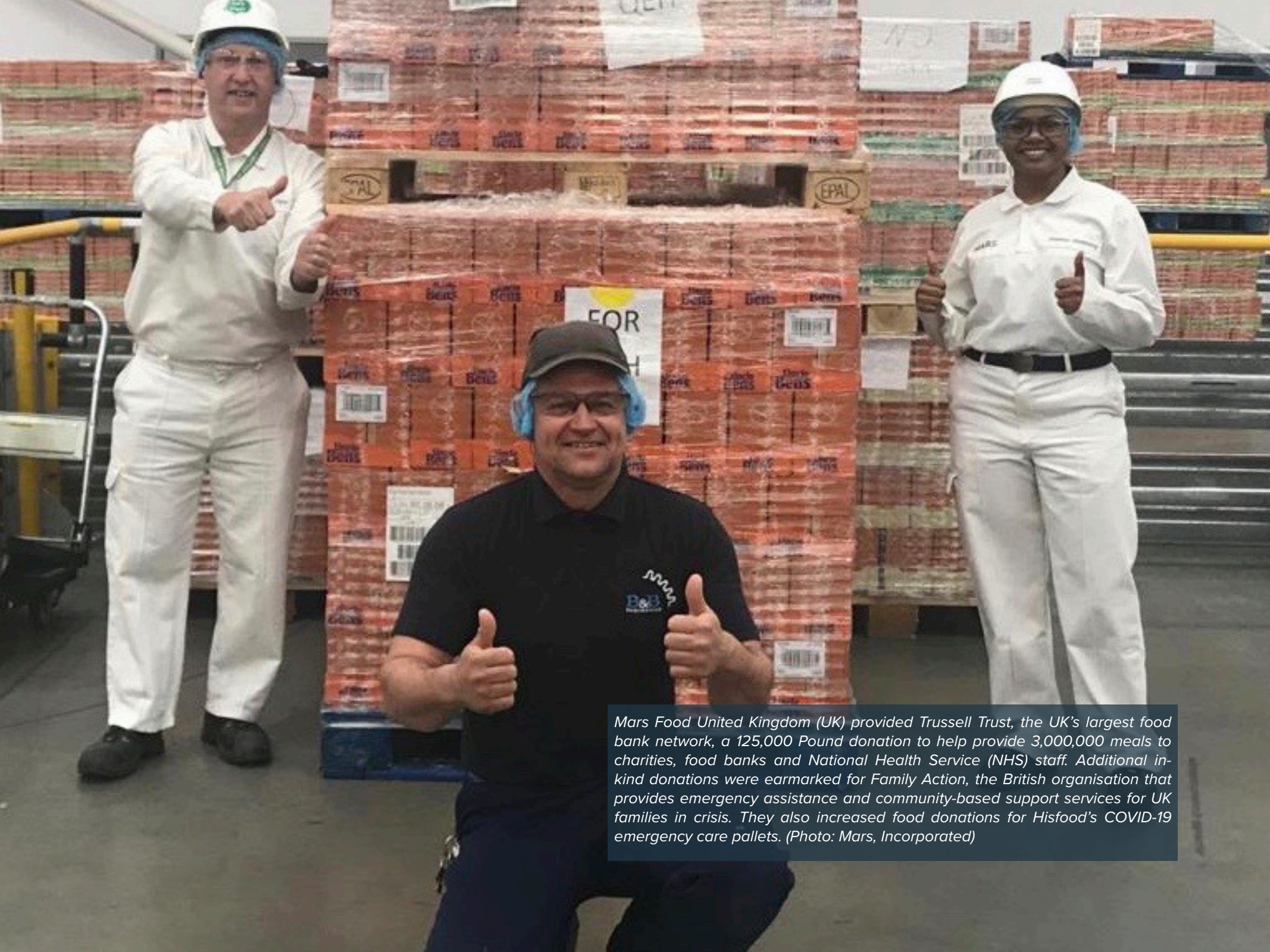
Mars Food United Kingdom (UK) provided Trussell Trust, the UK's largest food bank network, a 125,000 Pound donation to help provide 3,000,000 meals to charities, food banks and National Health Service (NHS) staff. Additional in-kind donations were earmarked for Family Action, the British organisation that provides emergency assistance and community-based support services for UK families in crisis. They also increased food donations for Hisfood's COVID-19 emergency care pallets.