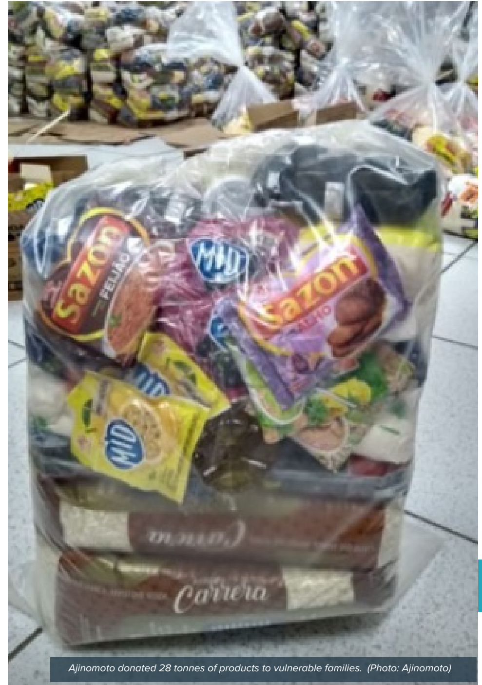
Ajinomoto donated 28 tonnes of products to vulnerable families.

Ajinomoto gave over 1,840,000 Euros in monetary donations in support of the most vulnerable communities. For example, the group's Brazilian affiliate donated 28 tonnes of products to vulnerable families and distributed more than 32,000 litres of alcohol to increase sanitising efforts. In Thailand, the Ajinomoto affiliate donated money and products worth 160,000 US Dollars to five hospitals to support frontline medical staff working to fight against the pandemic.