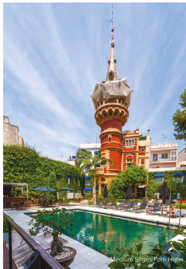
Medium Sitges Park Hotel

Capgemini, Coca Cola, D-Wave Systems, Google, GS1 Global, Impact Buying, Incept, Jerónimo Martins, Maersk, Metro Group, Migros Turkey, Nagel Group, PepsiCo, Pure Value, P&G, SPAR International, SyncForce, Winkler Technologies