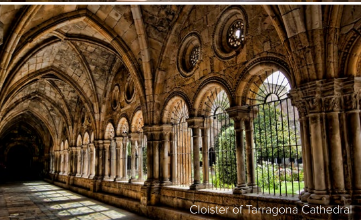
Cloister of Tarragona Cathedral