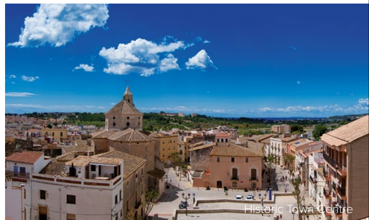
Historic Town Centre