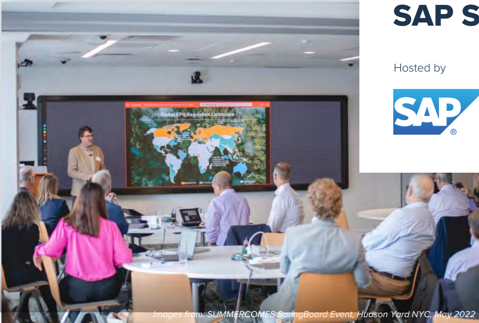
Images from: SUMMERCOMES SpringBoard Event, Hudson Yard NYC, May 2022

An in-depth look into how SAP navigates Sustainable Value Creation while driving Business Transformation