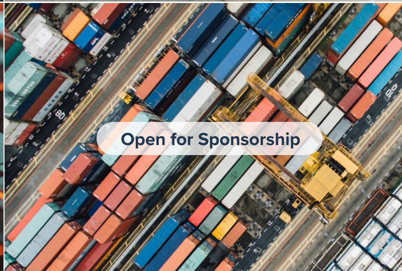
Open for Sponsorship

Discuss with experts on site the current trends and insights and learn from best practices.