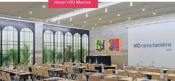
Hotel H10 Marina

Participants: Member of the E2E Steering Committee, plus Special Guests