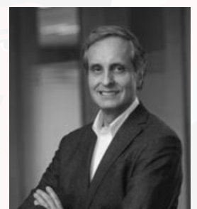
Daniel Servitje Grupo Bimbo